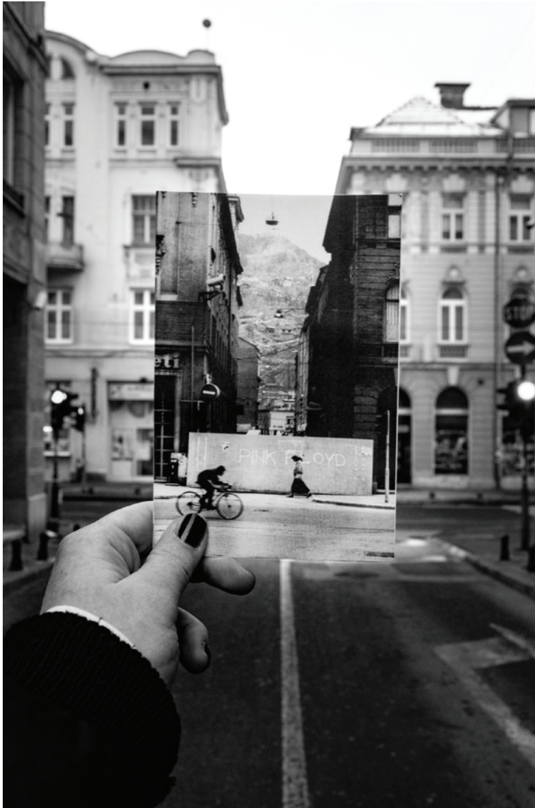
Ida Savić CREATIVE