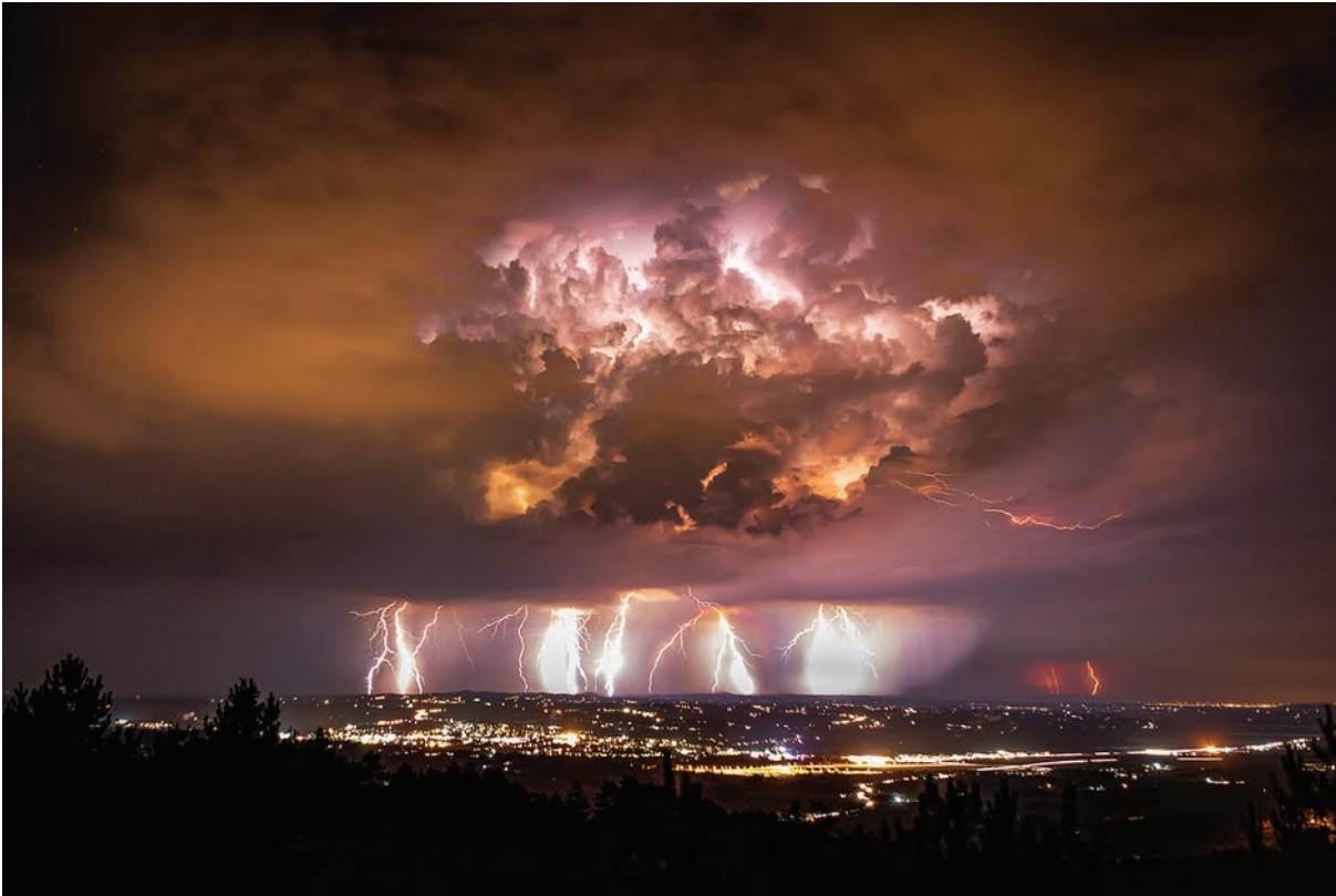
Boško Hrgić LANDSCAPE